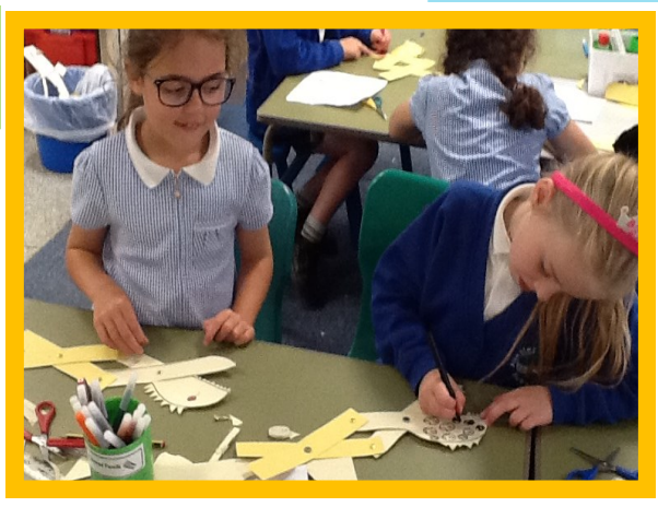
Year 2 have loved making moving monsters as part of our DT learning.