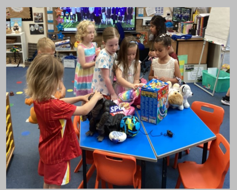
We have had a busy and fun last week in Reception , with our party on Wednesday and toy day on Friday. It's been such a lovely year and we are looking forward to a long summer break and coming back into Year 1!!