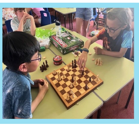
Year 5 having fun today with their toys they have brought in, some down time after all their hard work this year.