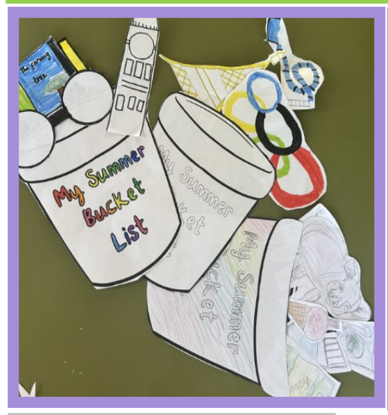
Year 4 have been putting their creativity to the test by making their summer bucket lists. They filled their buckets full of wishes for their summer.