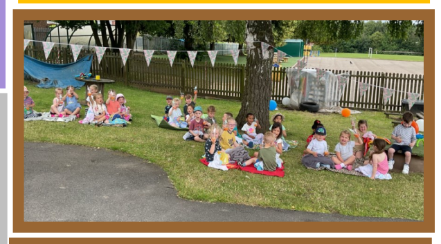
The Nursery children enjoyed a beach party this week. This included food and drinks, fun games and activities and playing in the paddling pool.